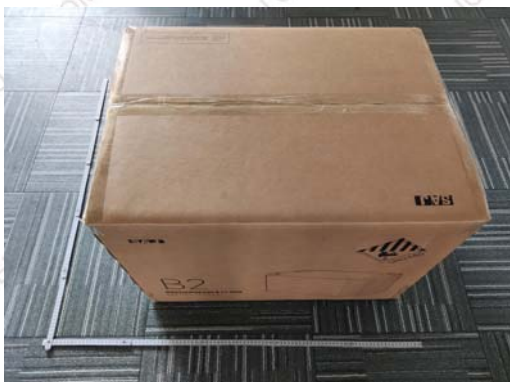
包装正面外观 Front appearance of Packaging