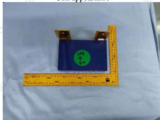
电芯外观 Cell appearance