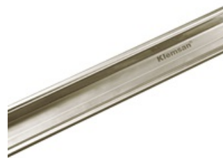
● MR 35x15 (1 m.)-MR 35x15 (1 m.) Non-Slotted