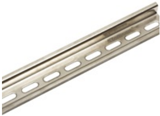
● 35x15, Slotted