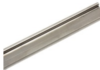
● MR 35x7,5 (1 m.)-MR 35x7,5 (1 m.) Non-Slotted