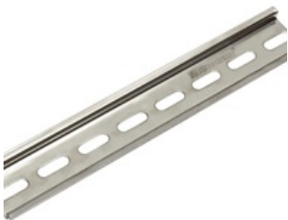
● 35x7,5 - Slotted